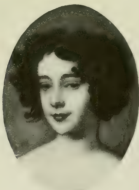
Top. CATHERINE OF BRAGANZA, QUEEN TO CHARLES II (By Jan Kneller) Left. BARBARA VILLIERS, DUCHESS OF CLEVELAND (By Sir Peter Lely) Right. LOUISE DE KEROUAL, DUCHESS OF PORTSMOUTH (By Pierre Mignard in the National Portrait Gallery) Bottom. NELL GWYN (By Sir Peter Lely in the National Portrait Gallery)